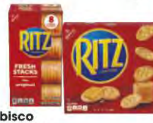
Nabisco Ritz Crackers Selected Varieties 8.8-13.7 oz. box