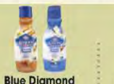
Blue Diamond Almond Breeze Almondmilk Creamer Selected Varieties - 32 oz. ctn.