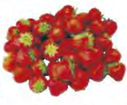
Red Ripe Strawberries 1 lb. ctn.