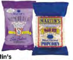
Martin's Value Size Popcorn Selected Varieties 7-10.5 oz. bag