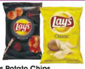
Lay's Potato Chips Or Snacks Selected Varieties 4.75-8 oz. bag