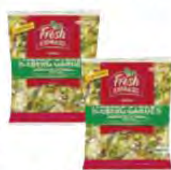
Fresh Express Garden Salad 12 oz. pkg.