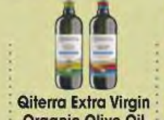
Chobani Oat Drink Selected Varieties 52 oz. ctn.