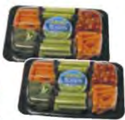
Taylor Farms Vegetable Tray 18 oz. pkg.