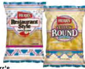
Herr's Tortilla Chips Selected Varieties 9-13 oz. bag