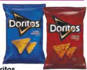
Doritos Tortilla Chips Selected Varieties 6-15 oz. bag