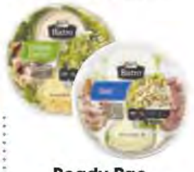
Ready Pac Bistro Salad Bowls Selected Varieties 4.5-7.75 oz. pkg.