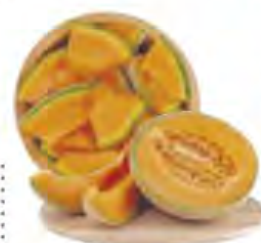
Jumbo Cantaloupes Sweet