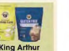
King Arthur Flour Gluten Free Measure for Measure Or Almond Flour 16 oz. Or 3 lb. bag