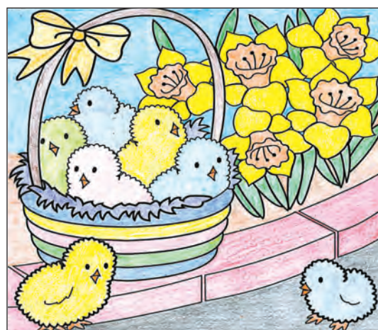
3 rd Place: Chip Trump Hamburg