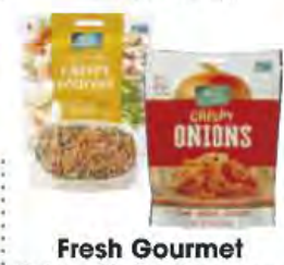
Fresh Gourmet Crispy Salad Toppers Selected Varieties 3.5 oz. bag