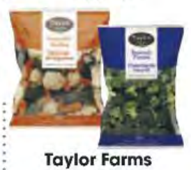
Taylor Farms Vegetables Selected Varieties 10-12 oz. pkg.