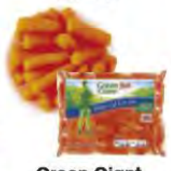
Green Giant Baby Cut Carrots 1 lb. bag