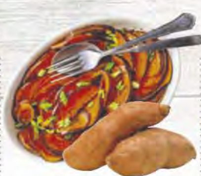
Southern Yams lb.