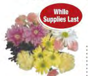
Easter Flower Bouquets