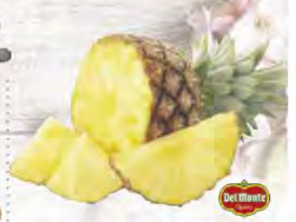
Del Monte Pineapple Golden Ripe