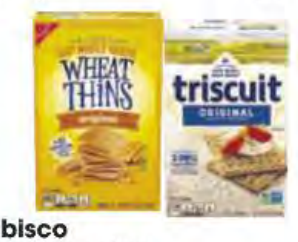
Nabisco Snack Crackers Selected Varieties 3.5-8.5 oz. box