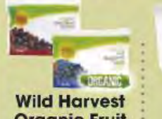
Wild Harvest Organic Fruit Cherries Or Blueberries 10 oz. bag