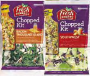
Fresh Express Chopped Salad Kits Selected Varieties - 7.7-12.3 oz. pkg.