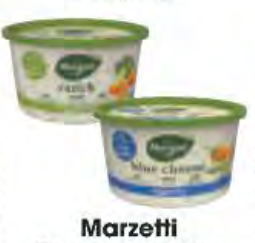
Marzetti Vegetable Dips Selected Varieties 14 oz. ctn.