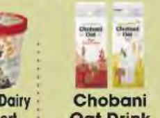
Planet Oat Non-Dairy Oatmilk Dessert Selected Varieties 16 oz. ctn.