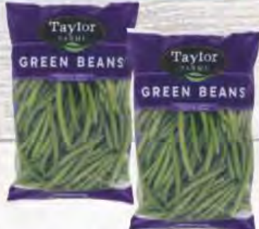
Taylor Farms Green Beans 12 oz. bag