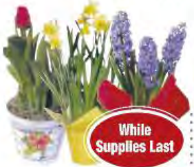
Easter Potted Plants Selected Varieties