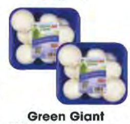
Green Giant White Mushrooms Whole 8 oz. pkg.