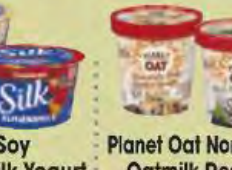
Silk Soy Almondmilk Yogurt Selected Varieties 5.3 oz. ctn.