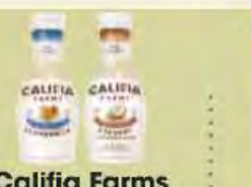
Califia Farms Almondmilk Or Oatmilk Selected Varieties - 32-48 oz. btl.