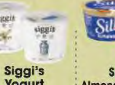
Siggi's Yogurt Plain Or Vanilla 24 oz. ctn.