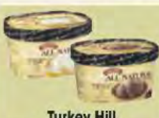
Turkey Hill All Natural Ice Cream Selected Varieties 46-48 oz. ctn.