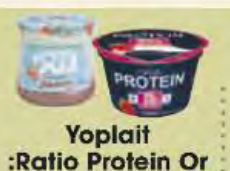
Yoplait Ratio Protein Or Oui Plant Based Yogurt Selected Varieties - 5.3-5.3 oz. cup