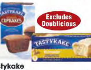
Tastykake Family Packs Selected Varieties 8-16.08 oz. pkg.