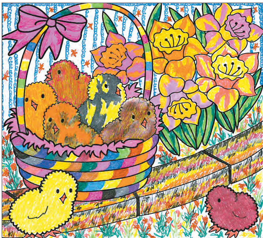
1 st Place: Elda Correll Hamburg