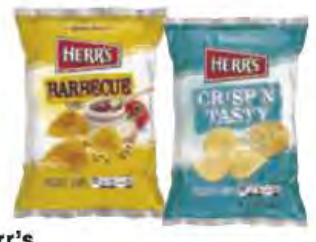
Herr's Potato Chips Selected Varieties 7.75-9 oz. bag