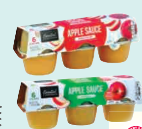
Essential Everyday Apple Sauce Selected Varieties 6 pk. 4 oz. cups 2/$5