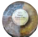
Old Home Kitchens Variety Crème Cake 31 oz. pkg. 8.99