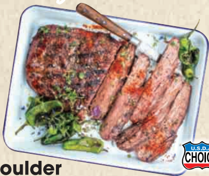
Shoulder London Broil Or Roast USDA Choice Beef