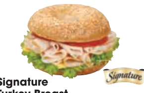
Signature Turkey Breast Deli Fresh, Honey Or Mesquite Smoked 6.99 lb.