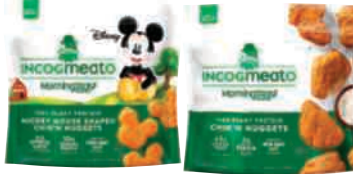
MorningStar Farms Incogmeato Chik'n Nuggets Or Tenders Selected Varieties 13.5 oz. pkg.