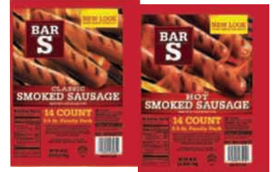
Bar S Smoked Sausage Selected Varieties - 2.5 lb. pkg.