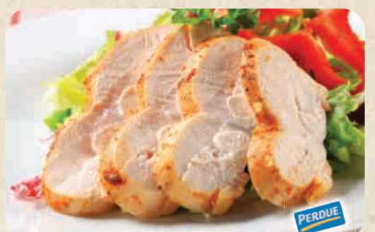
Perdue Fully Cooked Chicken Short Cuts Selected Varieties - 8 oz. pkg.