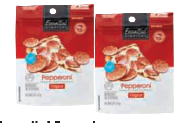
Essential Everyday Pepperoni Original 6 oz. pkg.