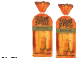
St. Pierre Brioche Loaf 17.6 oz. pkg. 6.99