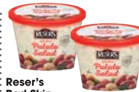
Reser's Red Skin Potato Salad 1 lb. pkg. 2.99