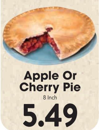
Apple Or Cherry Pie 8 Inch 5.49