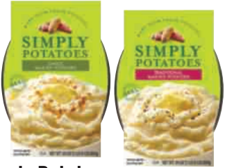
Simply Potatoes Mashed Potatoes Selected Varieties 20-24 oz. pkg.