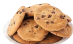
Fresh Baked Cookies 10-12 ct. pkg., Selected Varieties 4.99