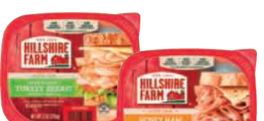
Hillshire Farm Lunch Meat Selected Varieties 7-9 oz. pkg.