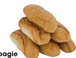
Hoagie Rolls 6 ct. pkg., Bakery Fresh 2.99