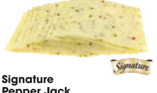
Signature Pepper Jack Cheese Deli Fresh 5.99 lb.