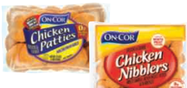
On-Cor Redi-Serve Chicken Strips, Patties Or Nibblers 24-27.5 oz. pkg.