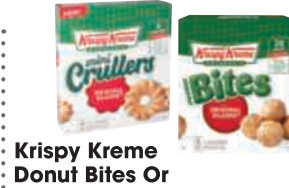
Krispy Kreme Donut Bites Or Mini Crollers 8 oz. box, Selected Varieties 4.99