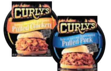
Curly's Pulled Pork Or Chicken 16 oz. tub