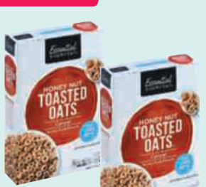
Essential Everyday Cereal Honey Nut Toasted Oats 14.5 oz. box 2/$5