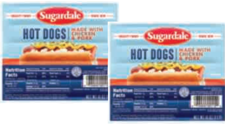
Sugardale Hot Dogs 16 oz. pkg.