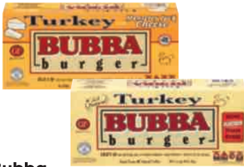
Bubba Turkey Burger All Natural Or Monterey Jack 2 lb. box