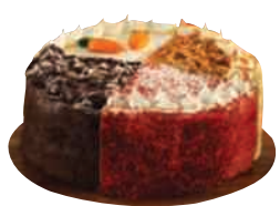
Double Layer 4 Flavor Cake 8 Inch 14.99