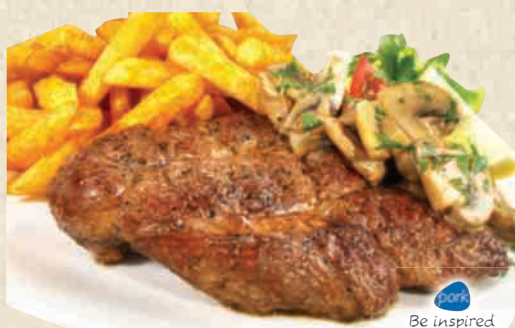
Pork Butt Steaks Fresh Bone-In