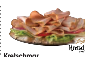
Kretschmar Ham Off the Bone Deli Fresh Selected Varieties 5.99 lb.