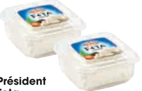
Président Feta Chunk Cheese 8 oz. pkg. 5.99