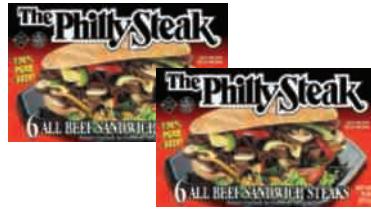
The Philly Steak All Beef Sandwich Steaks Frozen 9 oz. box