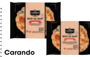
Carando Rip-N-Dip 8.5 oz. pkg., Selected Varieties 3.99