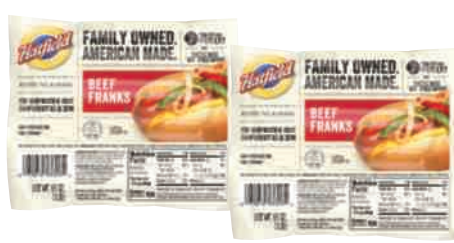
Hatfield Beef Franks 1 lb. pkg.