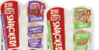
Hillshire Farm Snacked! Small Plates Selected Varieties 3.6-3.92 oz. pkg.