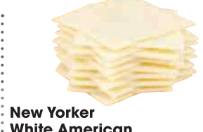
New Yorker White American Cheese Deli Fresh 5.99 lb.