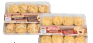
Café Valley Cream Cheese Coffecake Bites 10 oz. pkg., Raspberry Or Cinnamon 4.99