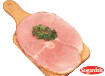
Sugardale Bone-In Smoked Ham Steaks