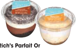
Rich's Parfait Or Cheesecake Cups 4.5-5 oz. pkg., Selected Varieties 2.49