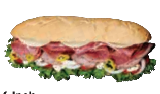
6 Inch Italian Hoagie Made Fresh In The Deli 3.99 each