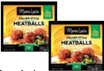
Mama Lucia Meatballs Italian Style 10 oz. pkg.