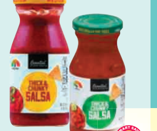
Essential Everyday Salsa Hot, Mild Or Medium 16 oz. jar 2/$4