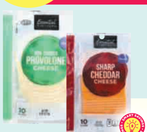
Essential Everyday Natural Sliced Cheese Selected Varieties 6-8 oz. pkg. 2/$5