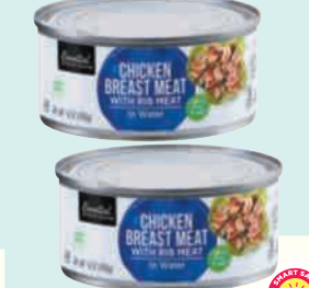
Essential Everyday Chicken Breast With Rib Meat In Water - 10 oz. can 3.49