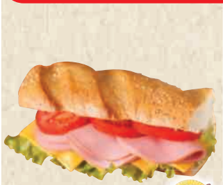
Hatfield German Bologna Deli Fresh 3.99 lb.