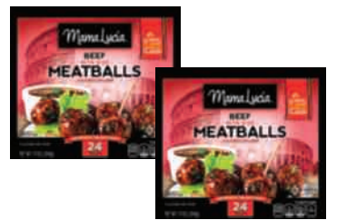
Mama Lucia 100% Beef Meatballs 12 oz. pkg.