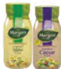
Marzetti Salad Dressing Selected Varieties - 12-13 oz. jar