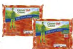
Green Giant Baby Cut Carrots 1 lb. bag