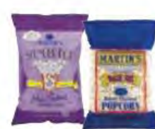
Martin's Value Size Popcorn