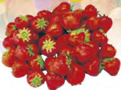
Red Ripe Strawberries 1 lb. ctn.