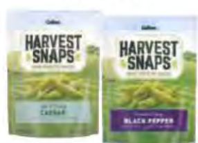
Harvest Snaps Green Pea Snack Crisps Selected Varieties - 3-3.3 oz. pkg.