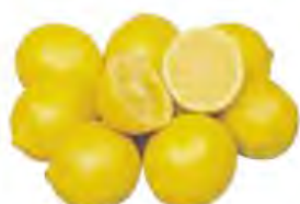
Large Lemons Fresh