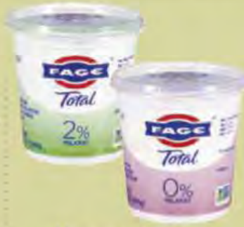
Fage Total Greek Yogurt