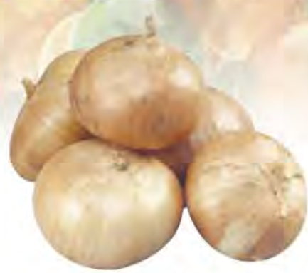
Jumbo Vidalia Onions