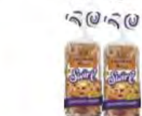
Thomas' Swirl Bread