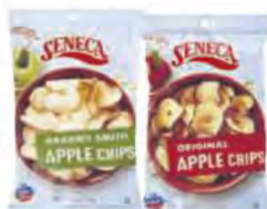
Seneca Apple Chips Selected Varieties - 2.5 oz. bag