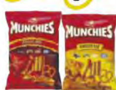
Frito Lay Munchies