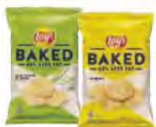
Lay's Baked Potato Chips