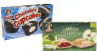
Little Debbie Family Packs