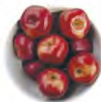
Red Delicious Apples 3 lb. bag