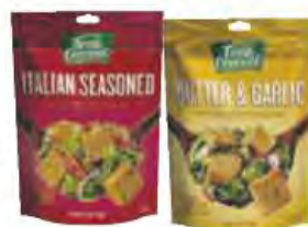
Fresh Gourmet Croutons Selected Varieties - 5 oz. pkg.