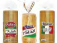
Maier's, Freihofer's Or D'Italiano Italian Bread