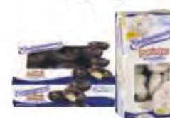
Entenmann's Donuts, Pop'ems Or Pop'ettes