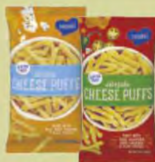
Barbara's Cheese Puffs