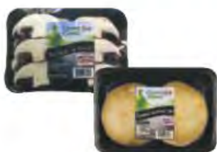
Green Giant Portabella Mushrooms Caps Or Slices - 6 oz. pkg.