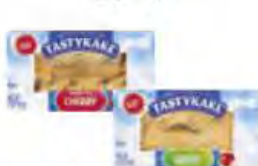
Tastykake Pies Or Pecan Swirls