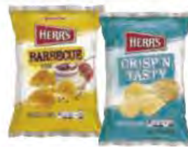
Herr's Potato Chips