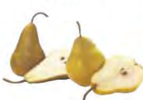
Bartlett Or Bosc Pears Premium