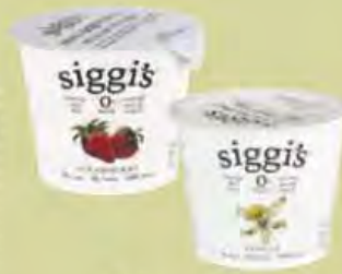
Siggis Icelandic Skyr Yogurt