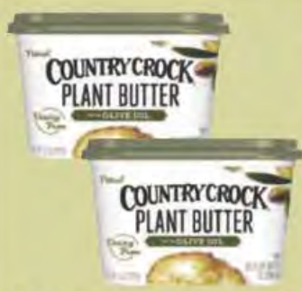
Country Crock Plant Butter