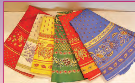
French Provence Tablecloths